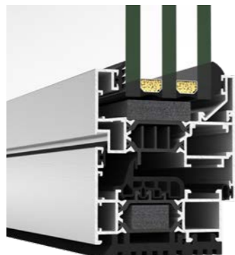
* Concealed drainage solution